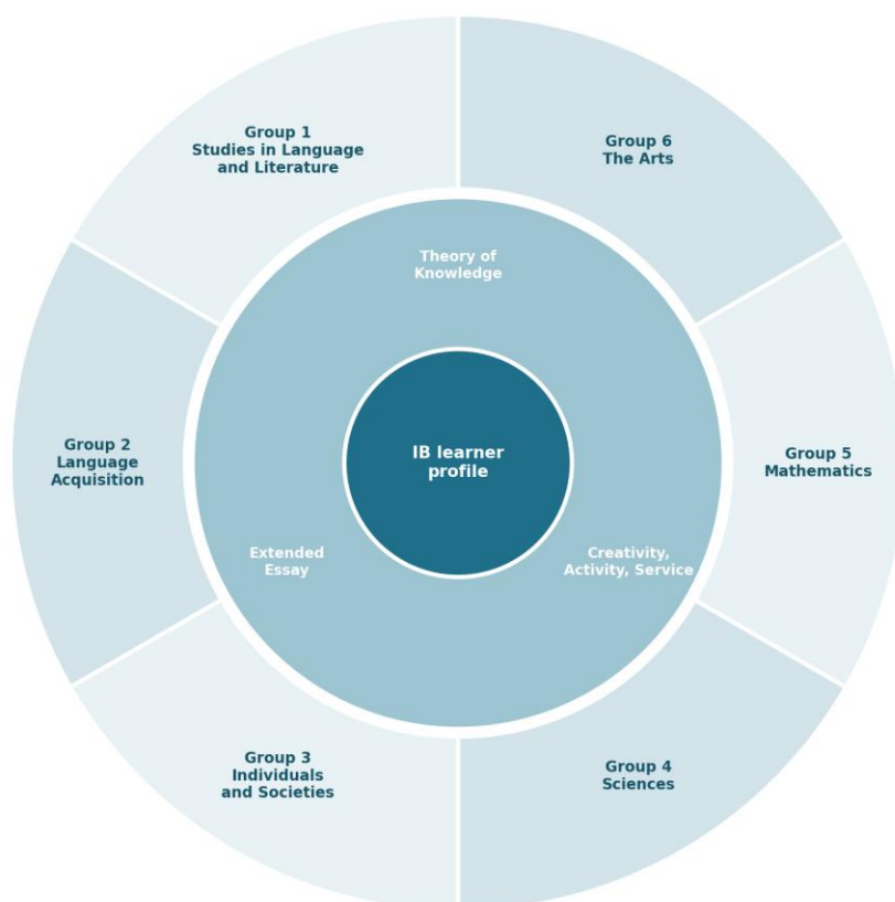
Figure 1. The structure of the IB Diploma Programme: the learner profile, the DP core and the six subject groups.

Students study six subjects, one from each of the six IB subject groups, three at higher level (HL) and three at standard level (SL). In addition, all students complete the three core elements: Theory of Knowledge (TOK), the Extended Essay (EE) and Creativity, Activity, Service (CAS). Subjects are graded from 1 to 7 and the core from E to A, with a maximum total of 45 points, as described in the school's Assessment Policy. The model below shows how the programme fits together: the IB learner profile at the centre, the three core elements around it, and the six subject groups forming the outer ring.